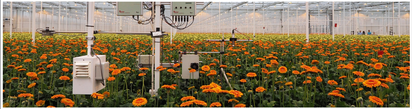
Plant factory of unique ingredients