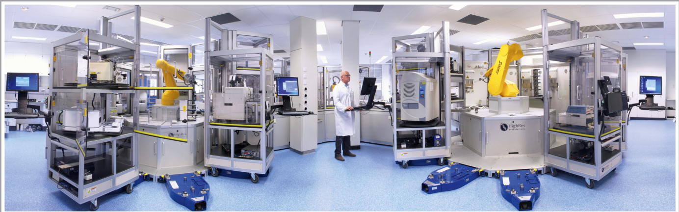
Identification of bioactive compounds